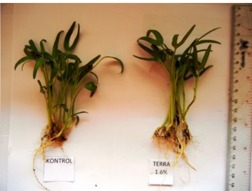
Kontrol – Terra 1.6%