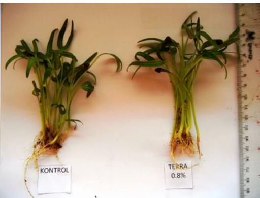
Kontrol – Terra 0.8%