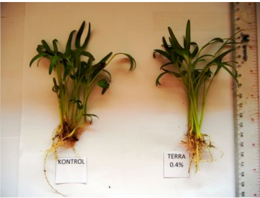
Kontrol – Terra 0.4%