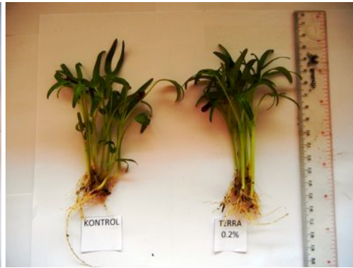
Kontrol – Terra 0.2%