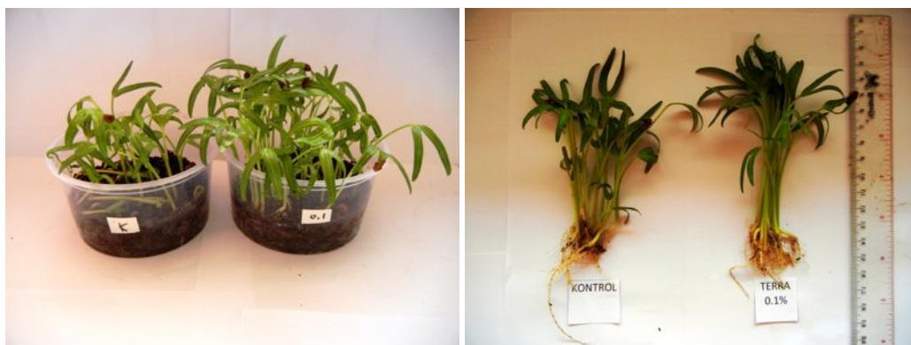
Kontrol – Terra 0.1%